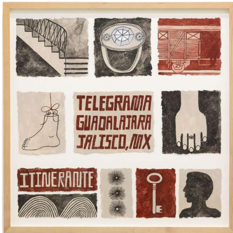
La mano (La main) (2021) Clay, silver leaf, and vinyl paint on paper, 26.5 x 26.5 in