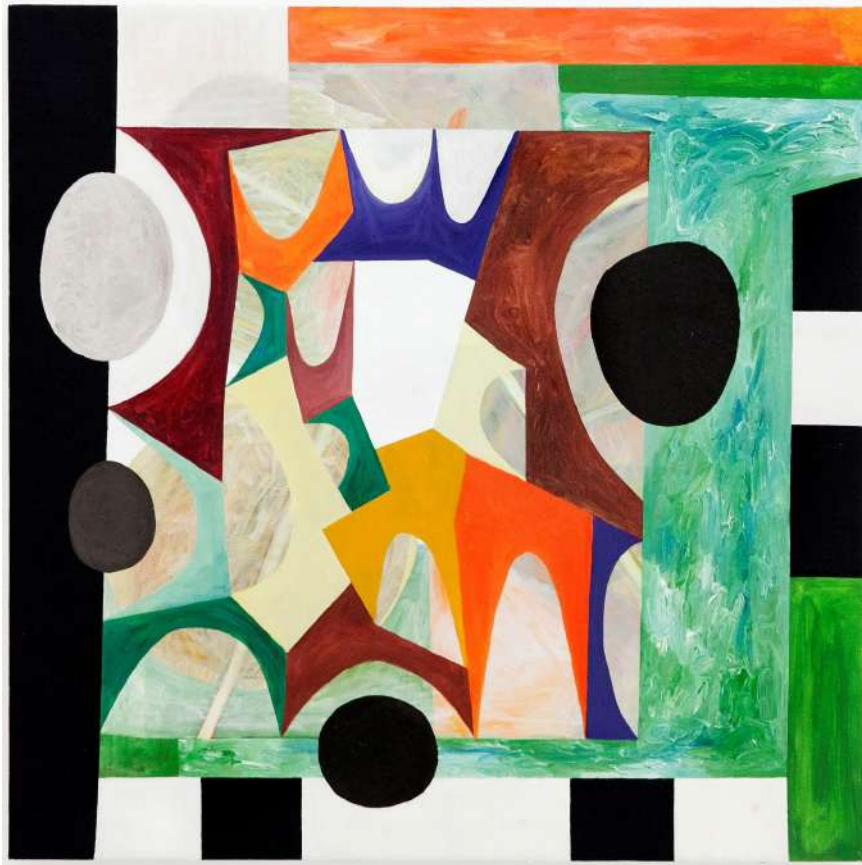
Colorless green ideas sleep furiously (2021) Oil on canvas, 30 x 30 in