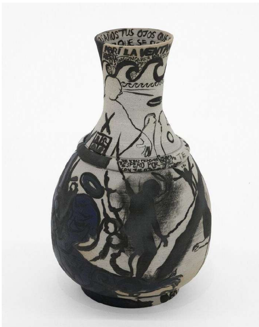
Tus Ojos Que Saben (2021) Ceramic and glaze, 16 x 10 x 8 in