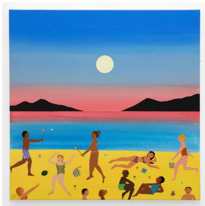
Badminton on the Beach (2021) Acrylic on canvas, 30 x 30 in

Across Wong's paintings, whether densely populated or sparse, a utopic sense of joy and acceptance emanates from her work. People of every imaginable background mix and mingle creating joyful scenarios devoid of prejudice or exclusion. Wong presents worlds that exist between the imaginary and real, a magical place that could be, not too far from reality.