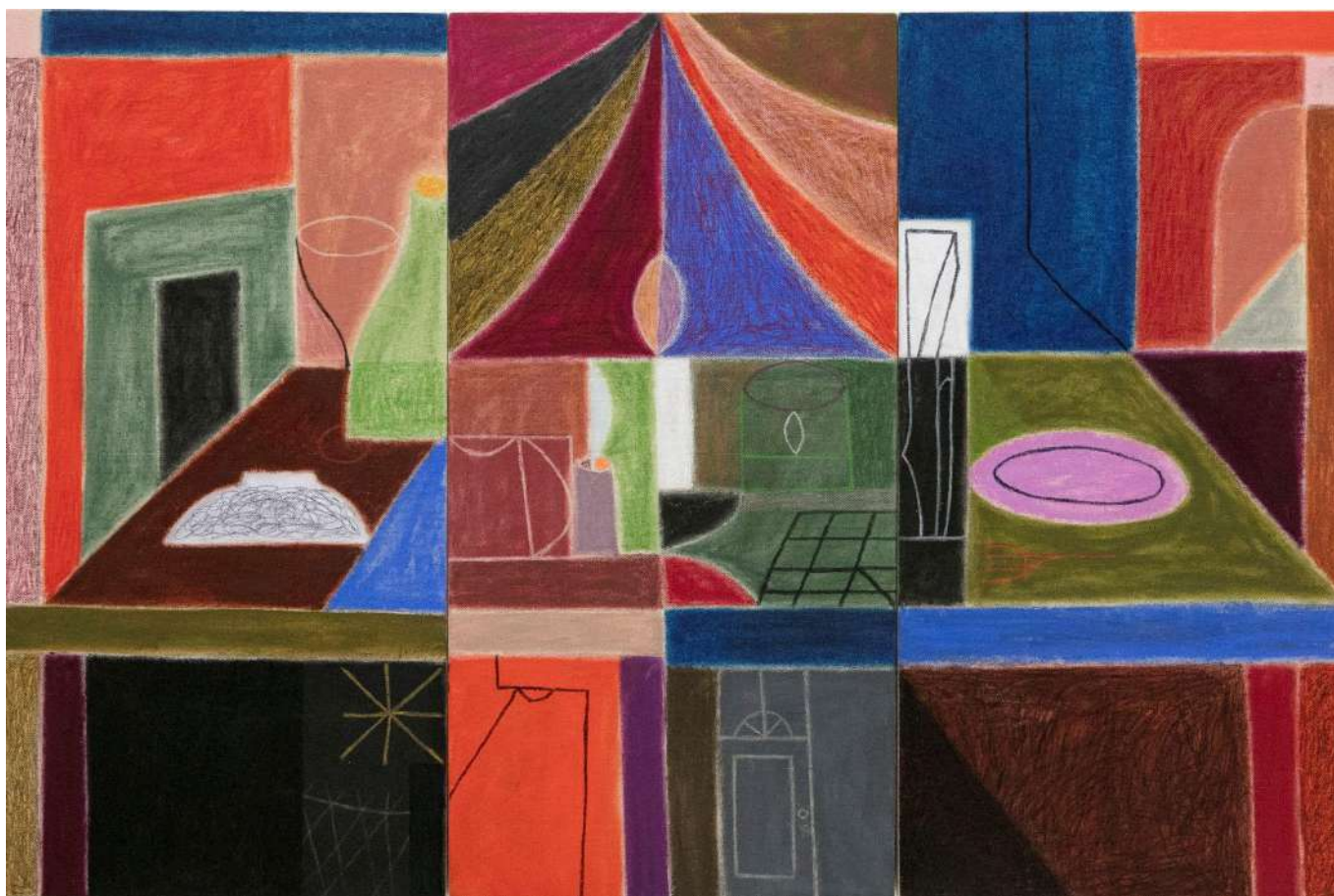
Two tables pushed together to make one big table (2021) Oil pastel on canvas, 24 x 36 in (triptych)

Oakland-based painter Muzae Sesay has shown widely since 2015, with dozens of solo and group exhibitions in the Bay Area as well as additional presentations in Los Angeles, New York, London and Copenhagen. Sesay's richly chromatic, geometrically structured works deftly allude to history, community, personal experience and the world around us. Much of his work explores the formation and fragmentation of memory, identity and human connection in relationship to environments and architectural spaces real and imagined.